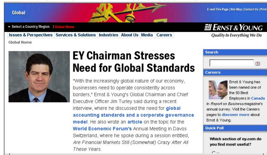
EXHIBIT 1: HOME PAGE – ERNST AND YOUNG ACCOUNTING FIRM

PriceWaterhouseCoopers' website also places a high emphasis on its current and potential client base. They convey a message that they put high importance on compliance and code of conduct (see exhibit #2 / www.pwcglobal.com ). Interestingly, Deloitte Touche, while their main target seems to be their clients, puts emphasis on a site that "alumni" employees can visit and network when the site was first visited. Six months later, Deloitte Touche's web site focused more on external customer and client services. (see exhibit 3 / www.deloitte.com ). KPMG's homepage highlights books and papers they have written (see exhibit 4 / www.kpmg.com ). They also offer information about services and recruiting information.