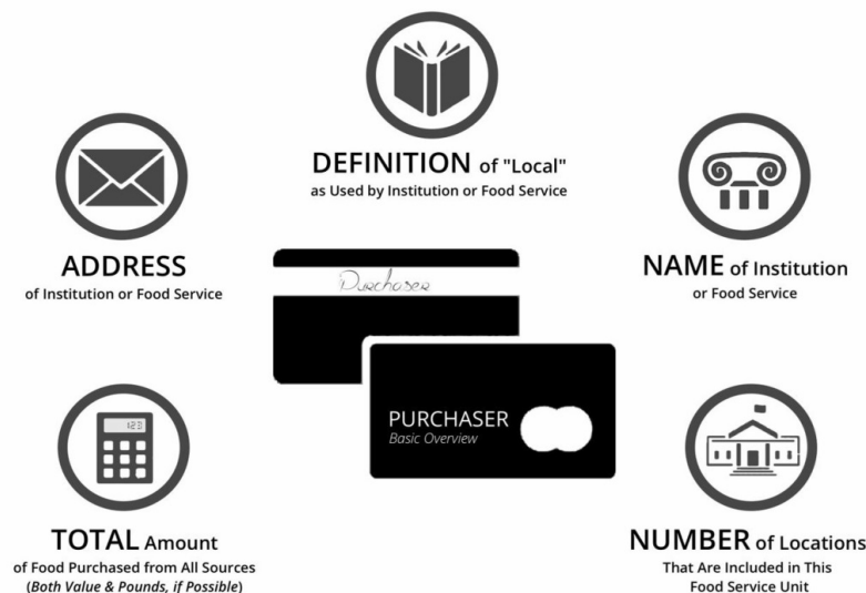
Figure 1. Purchaser data infographic.