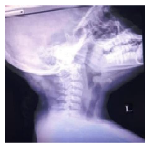
Figure 4: X-ray soft tissue neck

The most common type of clinical presentation is faucial diptheria. Diphtheria is a contagious disease due to toxigenic strains of the pathogen C. diphtheriae is usually spread by direct physical contact among humans by droplets or through inhaling aerosols of infected individuals. Beginning with sore throat, low grade fever and later an adherent greyish white membrane over the tonsils, pharynx, and nasal cavity (Figure 4). This thick and fibrinous pseudomembrane, which may dislodge and