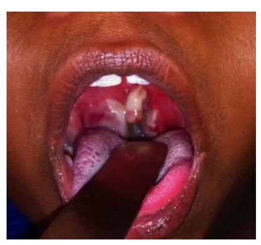
Figure 3: pseudomembrane in oropharynx