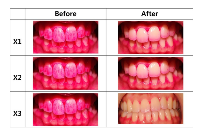
Figure 2. O'Leary index image of the saline gargle group, chlorhexidine gargle group, and Scutellaria root gargle group. X1: Oral care with 0.9% saline solution (1 min/15 ml); X2: Oral care with 0.005% chlorhexidine (1 min/15 ml); X3: Oral care with 10% Scutellaria root (1 min/15 ml).

The active bacteria count before using a gargle solution was high in all groups, and it was reduced in the order of saline gargle group, chlorhexidine gargle group, and Scutellaria root gargle group after using a gargle solution (Figure 3). As shown in Table 2, the chlorhexidine gargle group and Scutellaria root gargle group showed similar antimicrobial effects against active bacteria and Spirochaeta (p<0.05).