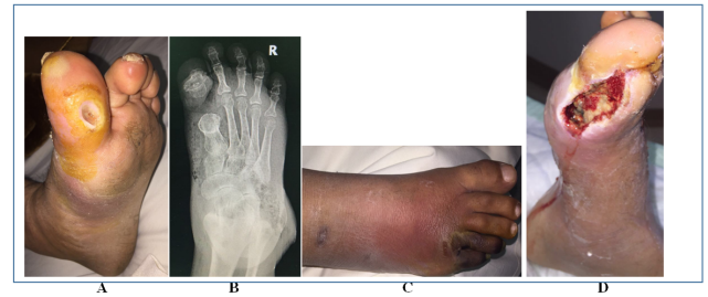
Figure 1. An ischemic ulcer in a diabetic patient (A), osteomyelitis in the hallux, cellulitis with gangrene of 4 th and 5 th toe, and a healing wound after partial amputation.

The data was entered and analysed by Statistical Package for Social Sciences (SPSS) v. 20. The descriptive analysis was done by frequency distribution tables and the graphical presentation was done by cluster bar charts. The inferential statistics were done through Chi square of independence.