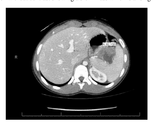
Figure 2: CT of pancreas with contrast showing thrombotic pseudoaneurysm of the splenic artery near the tail of the pancreas.

a pseudoaneurysm (PA) as blood leaks out and is contained by surrounding fibrotic tissues. Additionally, PA's are commonly associated with pseudocysts <sup>6,7,14</sup>.