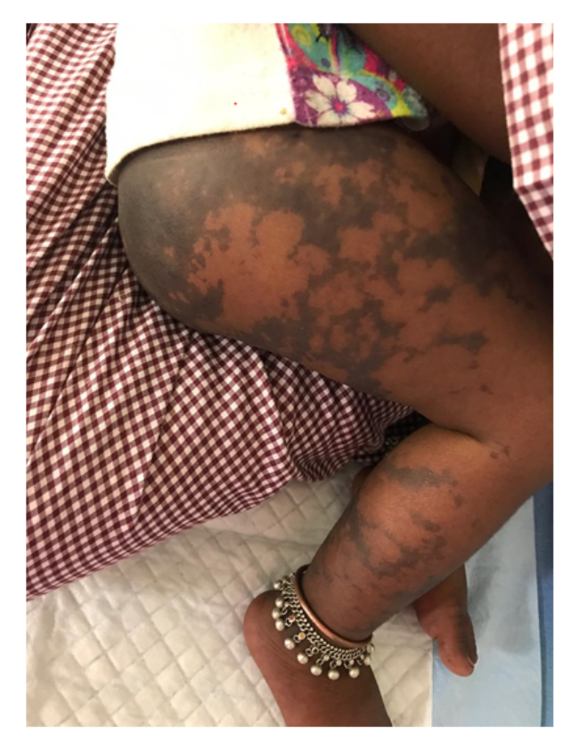
Figure 1. Child with Rickettsial fever showing purpura fulminans.

Although the test has low sensitivity and specificity, it is a simple and cost effective test that can guide the clinician in initiating appropriate treatment. In our study we performed Weil Felix in all suspected cases. We found that OX 2 positive in 13 patients (81%), OX 19 in 4 patients (25%) and OX K positive in 1 (6%) patient. Mittal et al. suggest that the Weil-Felix test could be used successfully as an initial screening test. Isaac et al. observed only 30% sensitivity at a titre of 1:80, but the specificity and positive predictive value were both 100% (Figure 1).