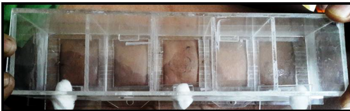
Figure 1: Repellent Activity of Different Essential Oils against Aedes albopictus Mosquito Using K & D Module.

Plenty of different techniques for mosquito vector control such as attractants, insecticides, repellents, biological environmental and genetics control etc. are in use which has their own merits and demerits. Hence it is essentially important to develop safe and eco-friendly techniques for the control of vector borne diseases especially in the field of mosquito. In rural communities, Plant-based repellents are still extensively used (Moore, 2006). At the latest, in market many commercial repellent products containing plant-based ingredients have gained increasing prominence between consumers because of their safe and non-toxic nature in comparison to popular trend of using synthetic repellents and reliable means of mosquito bite prevention (Isman, 1995).