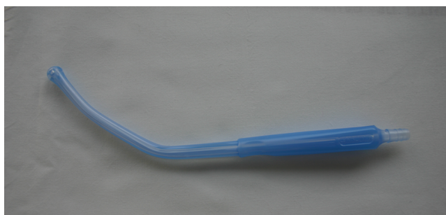
Figure 2: Rectal cannula.

before transfer to the endoscopy Unit where colonoscopy is carried out within one hour after completion of the cleansing procedure. To avoid formation of a bacterial biofilm in the internal circuit, a disinfection of the tubing with a light bleach solution (225 ml of 2.6% ac bleach) was enforced every day, followed by a thorough rinsing with water. Water was sampled 48 hours after each disinfection by the Hospital Hygiene Laboratory and cultured in accordance with standards enforced by the French legislation (NF ENISO6222, NFENISO16266) and NF ENISO9308-1). The external cleansing of the device was completed after each use with detergent and disinfectant products routinely in use in our hospital for non-critical surfaces (Aniosurf premium®, Laboratoires Anios®, Lille-Hellemmes, France) and validated at an European level (European standard tests EN 1040, EN 1276, EN 13727, EN 1275 and EN 1650).