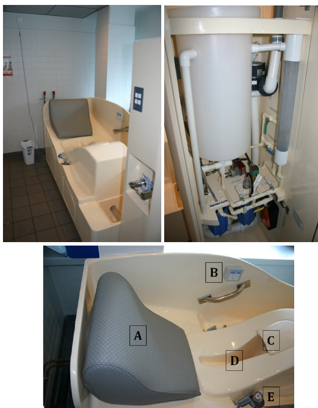
Figure 1: General view of the Angel of Water device used in the study (upper left panel). Inside view showing the water tank, the water circuitry and the filters (upper right panel). Patient seat (A) with an emergency switcher (B), the connection for the rectal cannula (C), the evacuation output (D) and the tap controlling the mixing of hot and cold water to the tank (E).

Patients with an indication of colonoscopy aged 18-80 years were included. Exclusion criteria were: history of colonic surgery, abdominal hernia, clinical suspicion of bowel obstruction or colonic stenosis, acute flare of inflammatory bowel disease, pregnancy, uncontrolled heart disease or renal insufficiency, weight >182 kg, known allergy or hypersensitivity to PEG. The study protocol was approved by the Regional Ethics Committee. Written informed consent was obtained from all patients. The trial was registered on Clinicaltrials.gov under NCT 01871584. The device for water infusion Angel of Water® (Lifestream, Austin, TX – FDA clearance K003720, June 27, 2002; CE-Mark 504677, May 22, 2006) is constituted of a 35L water tank maintained at 37°C by a heating system ( Figure 1 ). Water is filtered through ionic and ultraviolet filters and infused by gravity through a single-use cannula, into the rectum ( Figure 2 ) in 20-30 minutes. The patient sits on an adapted seat allowing easy passing of water and evacuation of feces, in a semi-reclined position. At the end of the procedure, the patient is asked to evacuate the remaining colonic content in the toilet,