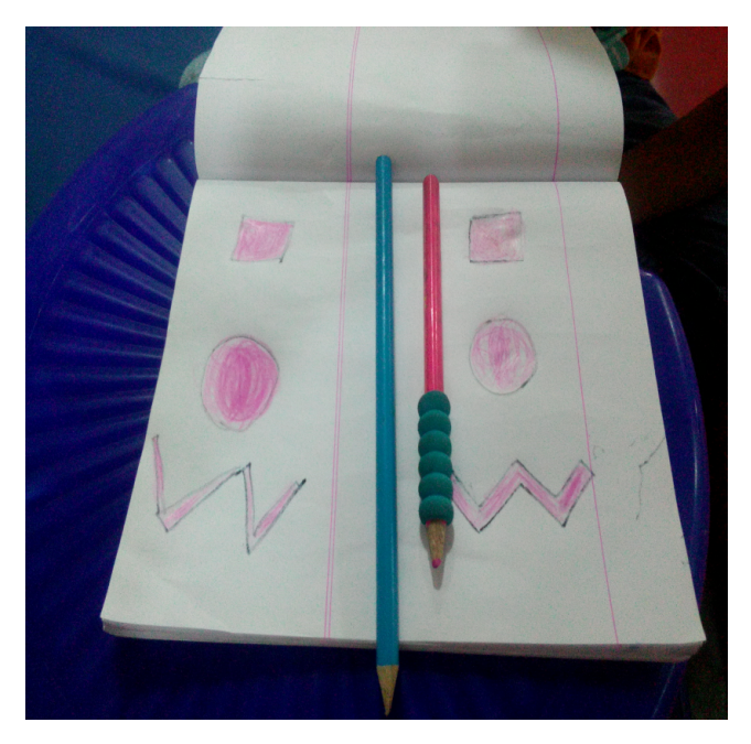
Figure 2. Copying and coloring task with and without gripper.