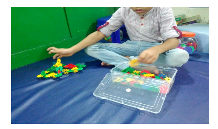
Figure 1. Visual perceptual task.