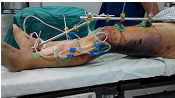
Figure 2. Appearance of injured leg.

Patients' family initially refused amputation at higher level and the patient was brought to the operating room for revisiting the left leg, including debridement, and Vacuum Sealing Drainage (VSD). Imipenem 1.0 g \times 4 and tigecycline 50 mg \times 2 were administrated instead for antibiotic therapy after sepsis shock occurrence. After surgery, the patient remained febrile, hypotensive and oliguric renal failure with a greater demand for vasoactive medications and rising lactate concentration (from 2 mmol/l to 5 mmol/l). On the fact of obvious extremis, the family agreed and the patient received middle of left leg amputation below hip and VSD irrigation. During the surgery the patient received multiple units of packed red blood cells and fresh frozen plasma. The patient had progressive multi-organ failure and deteriorating renal function requiring hemodialysis. After 72 h, Culture test confirmed the presence of A. hydrophila and Klebsiella in wound tissues but not in blood and sputum samples. A. hydrophila is sensitive to