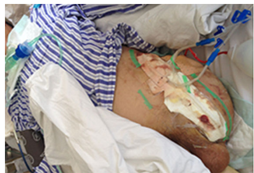
Figure 4. Appearance after amputation.

Based on available literatures from PubMed Database, clinical parameters of 10 relevant cases were summarized in Table 1. There were 8 males and 2 females, with a mean age of 59 y old (30-72). Among them, eight cases suffered systemic infection with predisposing factors such as hemodialysis, immunosuppression, diabetes and chronic liver disease. Five cases were without contact history with any aquatic animal, so the infection source could be stagnant water with