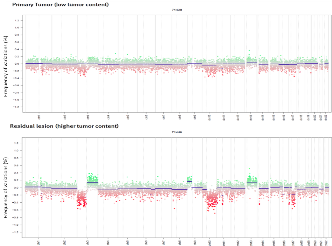
Figure 3. DNA methylation-derived subgrouping in primary tumor (upper) and in the residual lesion (lower) Chr: Chromosome