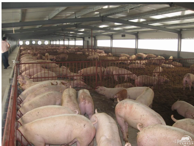
Figure 2. Landrace pigs in A Pig breeding farm of Tianjin.

Test equipment: Camera, a display, a standard than swatches, pH meter, wire, plastic bags, electronic balance, absorbent paper, surgical knife.