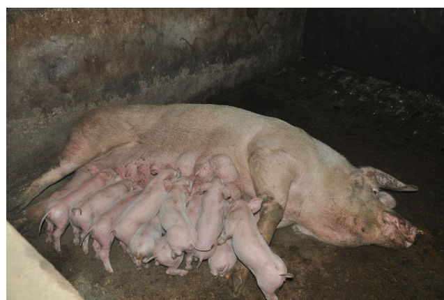
Figure 1. Landrace pigs breast feeding behavior.