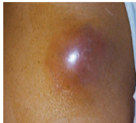
Figure 1. Chest examination

Investigations revealed hemoglobin level of 10.8 g/dL with a normal mean corpuscular volume and mean corpuscular hemoglobin. Leukocytes: 10.8 \times 10^9/L with neutrophils: 7.08 \times 10^9/L , lymphocytes: 2.63 \times 10^9/L , platelets: 577 \times 10^9/L , and C-Reactive Protein (CRP): 147 mg/L. Purified protein derivative skin test and gastric aspiration were both negative. Pulmonary function test was consistent