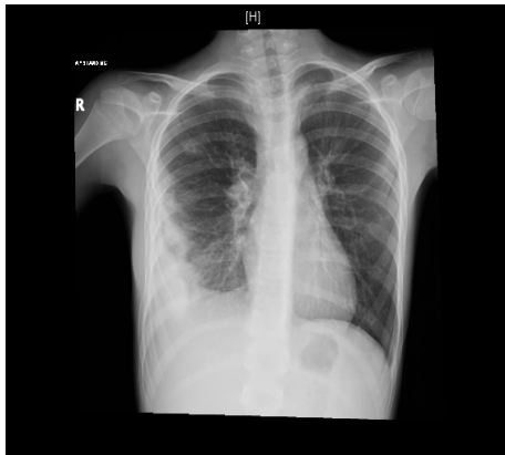
Figure 2. Chest radiograph