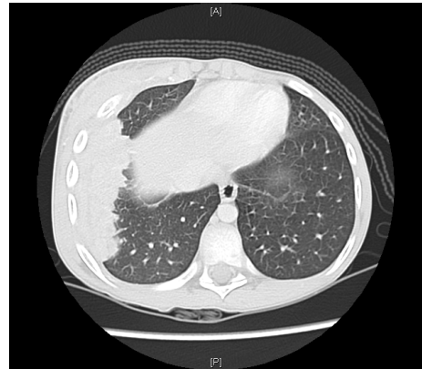
Figure 4. Computed tomography (CT) scan that shows periosteal reaction and destruction

Our review (Table 1) consisted of 35 cases of pulmonary actinomycosis in patients aging 18 years and younger, gathered by using the Pubmed database. The first case was in 1958 and the last one in 2013. The average age was 9.5 years, ranging from 27 months to 16 years (17 male,