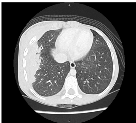
Figure 3. Computed tomography (CT) scan with contrast shows lung parenchyma