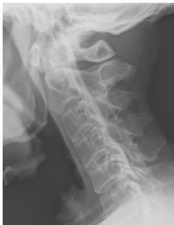
Figure 1. Lateral plane radiographs showing a continuous arch from C1 to C5.

Since the symptom of cervical spine was mild, the patient was treated with decompression laminectomy of the thoracic spine firstly.