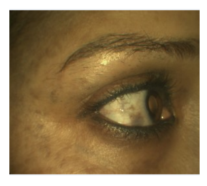
Figure 1. Clinical examination finds patches of blue-slate color in the skin (in the territory of the first branch of the trigeminal) and in the sclera.

This is a 42-year-old patient who consults for a change of optic correction, for whom the systematic examination reveals a sectoral iris heterochromia evolving since her childhood and which increases discreetly in size, according to the patient. Clinical examination finds patches of blue-slate color in the skin (in the territory of the first branch of the trigeminal) and in the sclera (Figure 1). The iris presents a sectoral hyperpigmentation ranging from 6 hours to 1 hour (Figure 2). This makes it possible to make the diagnosis of sectoral oculodermal melanocytosis. Intraocular pressure is normal. At the back of the eye, bilateral papillary excavation at 3/10 is noted.