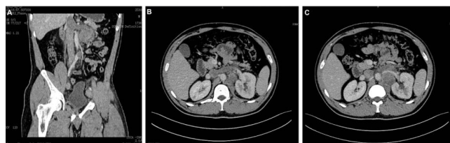
Figure 1. Computed tomography of the patient revealing tumour metastasis and venous tumour thrombus. A. The inferior vena cava tumour thrombus as the arrow indicates; B. Renal venous tumour thrombus as the arrow indicates; C. The abdominal cavity metastasis of the testicular mixed germ cell tumour as the arrow indicates.

Laparotomy was performed using a median abdominal incision extending from the xiphoid to pubic symphysis. Splenicocolic ligament was freed and the IVC and aorta were exposed. The inferior vena cava was separated straight up to the second porta. The liver was completely mobilized by the piggyback technique, dividing the falciform, triangular, and coronary ligaments, and the IVC was completely exposed to the hepatic veins. After complete hepatic mobilization and IVC cross-clamping, hepatic vascular exclusion was performed to prevent bleeding from the hepatic vein and hepatic congestion. The suprahepatic IVC, infrarenal IVC, contralateral renal vein, and hepatic vein were occluded in sequence. Following administration of heparin, clamps were applied successively to the distal IVC, renal vein contralateral to the tumour, and upper IVC proximal to the thrombus. A lateral venotomy was performed from the ostium of the tumoural renal vein to the IVC beyond the proximal limit of the thrombus and the thrombus was removed under direct vision. The invasion was not detected in the inferior vena cava wall. Primary repair of the cavotomy was sutured by Prolene suture line, without prosthetic graft interposition or patch angioplasty. After closure of the IVC, radical nephrectomy and RPLND were performed. Following surgery, the patient was transferred to the intensive care unit. The surgery endured for 420 min and intraoperative bleeding loss was 12 000 ml.