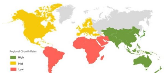
Cardiovascular devices Market - Growth Rate by Region (2018)

The United States dominates the cardiovascular units market, owing to the high incidence of cardiovascular disease, the high adoption rate of minimally invasive procedures, the presence of reimbursements, rising geriatric population, and the excessive demand for non-stop and home-based monitoring.