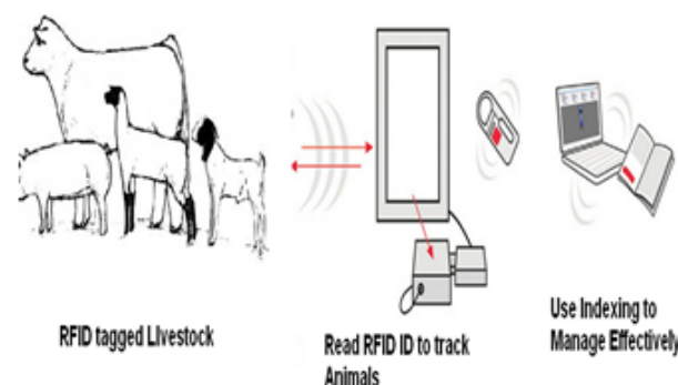
Figure 1. RFID enabled livestock management.

and store the analysed substance again in the database that is ready to be inoculated. High efficiency animals can be cross-bred with the goal that we get a quality item and can expand the generation (Figure 1).