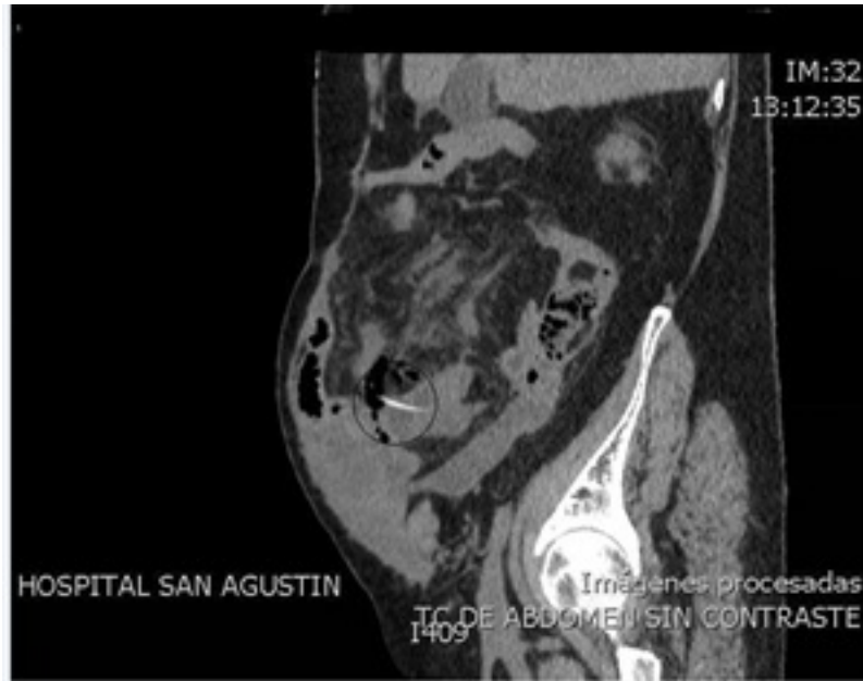
Figure 2: The foreign body was traversing the wall of a handle, relating to a small collection of extraluminal bubbles, findings suggestive of undercover drilling.