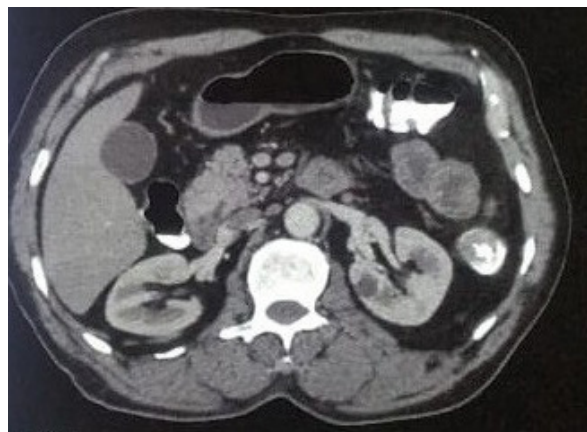
Figure 1. Triple phase computed tomogram scan of abdomen showing contracted gall bladder with irregular asymmetrical thickening of 6 mm in fundal region of gall bladder. Fat planes with adjacent liver were ill defined.

Needle Aspiration Cytology (FNAC) from gall bladder which was inconclusive. In view of abnormal thickening, patient planned for surgery [10].