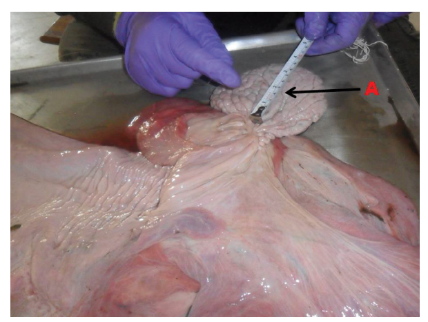
Figure 2: (A) Photograph showing the measurement of ovary of Asiatic elephant ( Elephas maximus ).