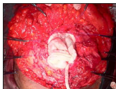
Figure 4. Huge hernia defect