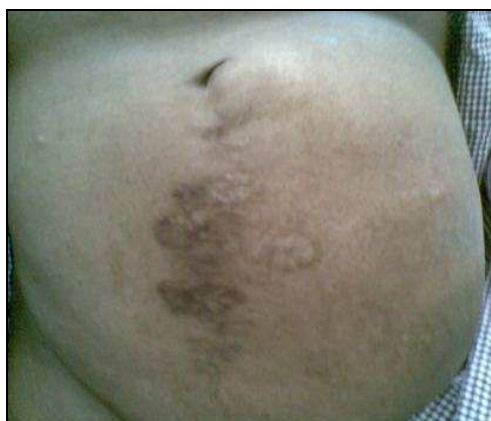
Figure 1. Patient with Giant incisional hernia

A 54 year old female presented in surgical O.P.D with complaints of swelling over anterior abdominal wall at previous surgical scar since one year and pain since 4