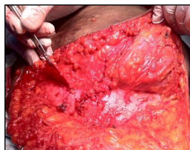
Figure 2. Previous onlay mesh has migrated