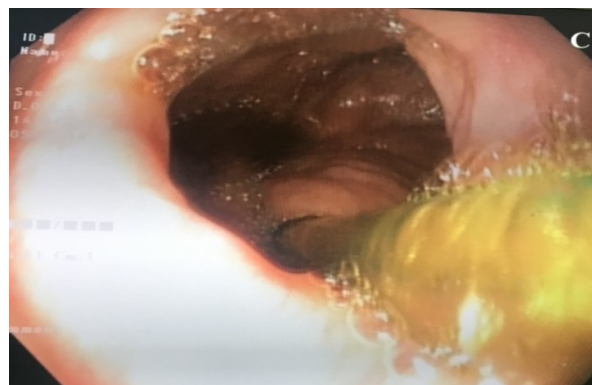
Figure 3. NG tube placement to keep the lumen of esophagus open.

According to the patient's age and general condition, the surgeon consultation considered her as inoperable and offered a surgical gastrostomy. So an endoscopic diverticulectomy planed as a therapeutic option for the management of patient's problem (Figures 3 and 4).