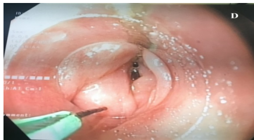
Figure 4. Cutting of cricopharyngeal muscle and septate between diverticula and esophagus with needle knife.