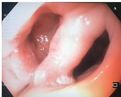
Figure 1. Entrance of esophagus beside large diverticula.

We supposed these reposts compatible with diverticula. A barium swallow requested, but the patient was so disabled and unable to do it. So at first the food remnant exsect by a basket, then after several attempts (Figures 1 and 2).