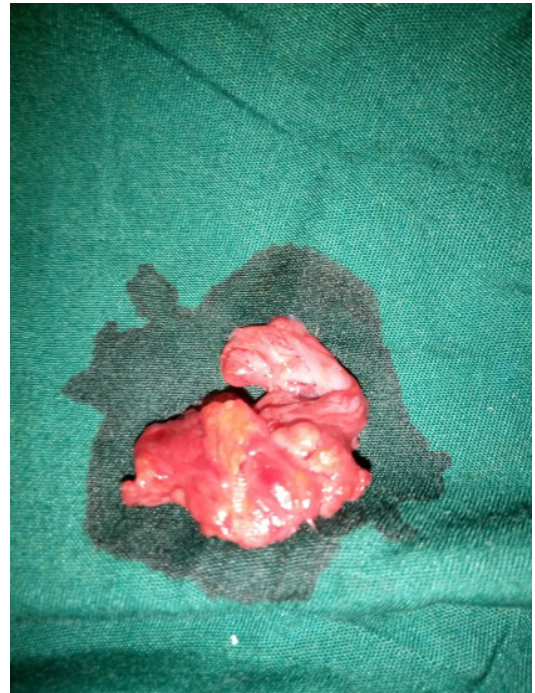
Figure 3: Cyst wall