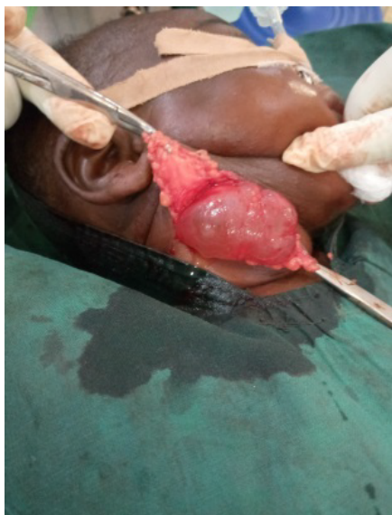
Figure 2: Cyst enucleated during surgery