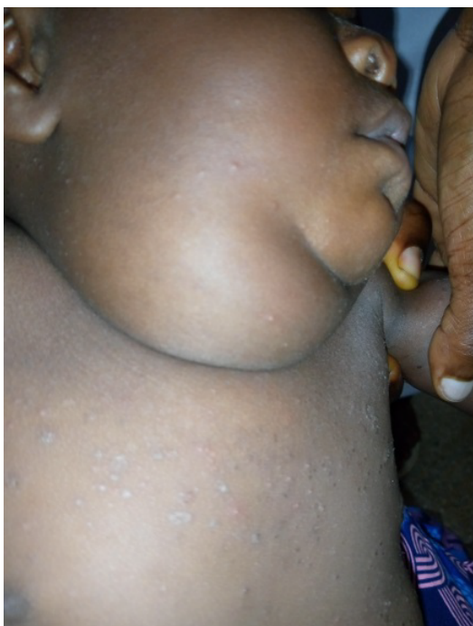
Figure 1: A 5months old baby boy the with large tumor on right side of neck

Kaduna from the Pediatric Outpatient Clinic with complaints of right sided neck swelling which was present since birth but has been gradually increasing size. The child weighed 5.8kg. On examination, there was a large swelling in the cervical region on the right side of neck measuring 12 X 6 cm 2 (Figure 1). The swelling was non-tender, fluctuant, easily compressible and transluminant, located in the posterior triangle of the neck. Aspiration biopsy yielded yellow colored fluid. Ultrasonography of neck region showed cystic swelling, which measure 29.0cm 3 . There was significant internal echoes within it and has septations. It is avascular and