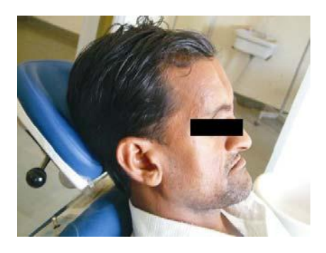
Fig. 2: Patient's profile showing concavity due to underdeveloped maxilla.