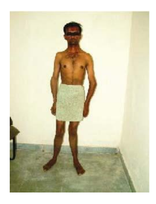
Fig. 3: Patient shows bowing of the bones of hands and feet.