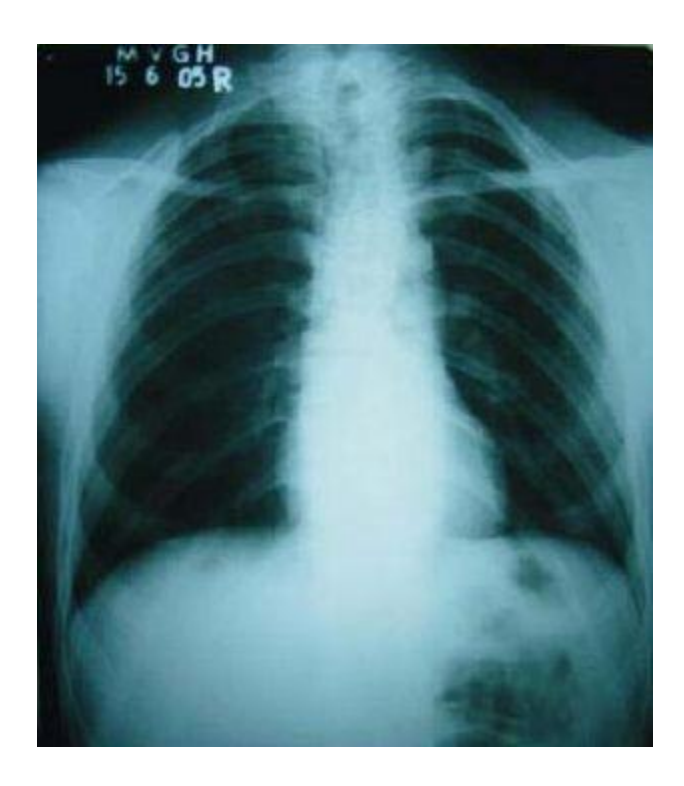
Fig. 8. Chest radiograph showing hypoplastic appearance of the clavicles, they were not angulated as normally seen and scapulae were laterally placed.