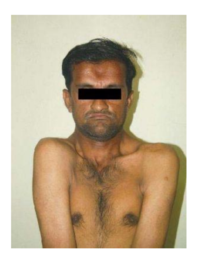
Fig. 1: The Patient of Cleidocranial dysplasia Showing hypermobility of right shoulder and depressed forehead.