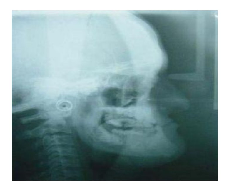
Fig. 7: In Lateral cephalogram, underdeveloped maxilla, Deep mandibular notch and rounded gonial angle seen Cleidocranial Dysplasia – A case report