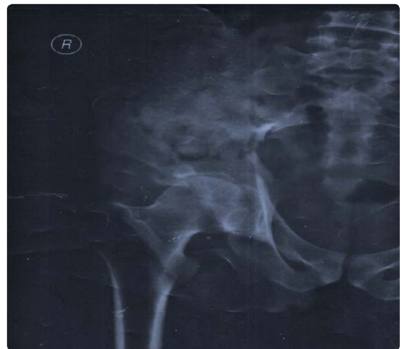
Figure 2. X-Ray right hemipelvis showing metastasis.

Thus, a strong possibility of distant metastasis should always be considered in symptomatic patients of advanced head and neck cancer.