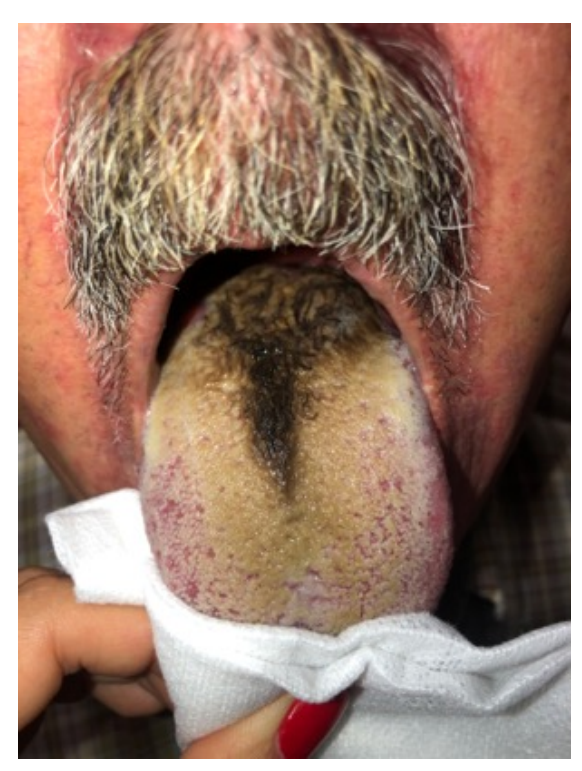
Figure 1: Characteristic appearance of black hairy tongue before medical treatment

The objective examination of the oral cavity revealed the total absence of teeth and the use of a total dental prosthesis in the upper and lower dental arches, according to the patient for about 10 years. It was evident the significant elongation of the filiform papillae of the posterior two thirds of the lingual dorsum, with a black colour and not detachable, giving the tongue a hairy appearance (Figure 1). No lesions were identified in the oral cavity. The remaining ENT examination was normal.