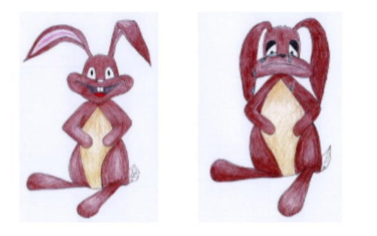
Figure 2. Examples of a positive (happy) and a negative emotional state (sad) of the Picture Stress Test (PST).

introduced to the assessment tool by a short story including the neutral rabbit, where the child is told that the neutral rabbit awaits a challenging task and perceives different feelings (showing the 5 rabbits with different emotional states). The child is then asked to identify all emotional states represented by the different rabbits. Emotional states that the child does not identify are explained by the tester. Finally, the child is asked to choose one of the emotional rabbits which best mimics the child's own current emotional state when awaiting a challenging task at baseline prior to the task. The choice of the rabbit picture with a specific emotional state is noted and is similarly reassessed at further time points during and after the stress task. In order to test whether coded facial expression of negative or positive emotions corresponded with the choice of the rabbits, children's choices were summarized in one variable reflecting rabbits with negative emotions (anxious, afraid, angry and stressed) and one with positive emotions (happy) similar to the video-coding strategy of facial expression data. Neutral rabbits are not considered for analyses.