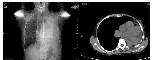
Figure 1. Chest computed tomography revealed a pronounced mediastinal shift to the left.

showed second-degree atrioventricular block. Pulmonary function indicated moderate restrictive ventilatory dysfunction.