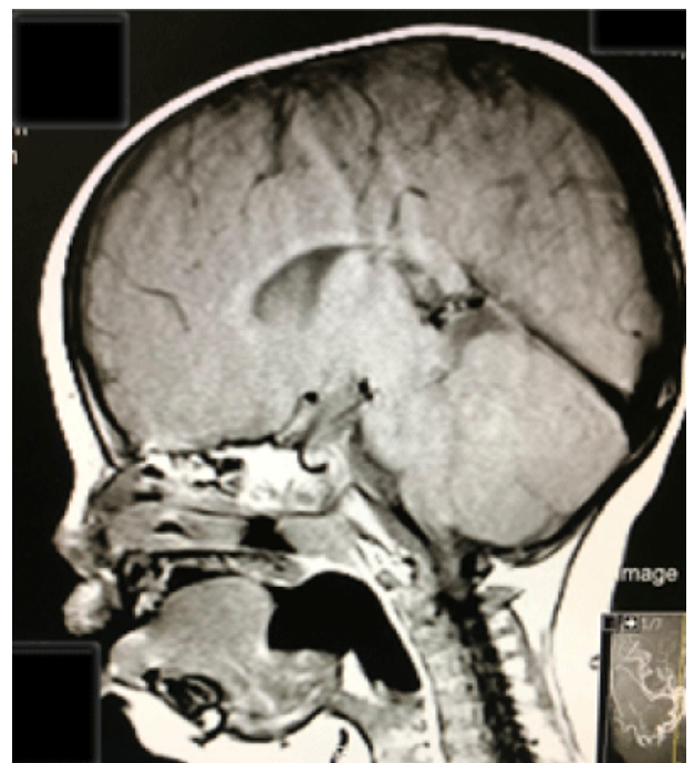
Figure 4. Normal MRI-Brain – side view.