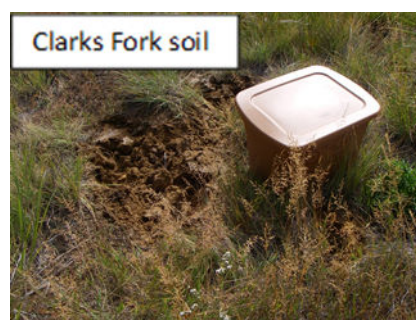
Figure 2. Clarks fork soil.

Tissue As, Cd, Cu, Pb, and Zn concentrations were above the normal soil concentration range reported [15] at 436, 6.0, 2101, 534, 2331, and 1295 \text{mg kg}^{-1} , respectively (Table 1). Corresponding species and cultivars within species tissue concentrations for Cd, Pb, and Zn were within the normal range [2,15]. Tissue As concentrations in FirstStike slender WG (7.1 \text{mg kg}^{-1} ), and Secar (6.0) Snake River WG exceeded