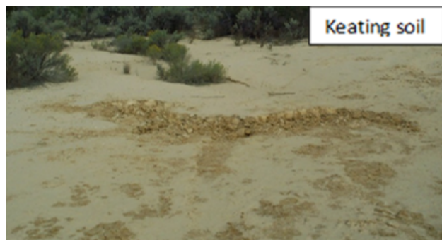
Figure 4. Keating Soil.

Tissue Cd concentrations exceeded the normal level of 1.3 \text{ mg kg}^{-1} [15] in all species and cultivars within species (Table 2) on this soil. Species ranking for Cd levels were Basin WR ( 4.7 \text{ mg kg}^{-1} ), bluebunch ( 4.1 ), slender ( 3.8 ), thickspike ( 2.2 ), and Snake River WG ( 2.1 ). Within each tissue Cd levels ranged from 2.0 to 6.3 \text{ mg kg}^{-1} in Secar Snake River WG and Charleston Peak slender WG, respectively (Table 2). Basin WR, blue bunch WG and slender WG species and cultivars within species had BCF > 1 for Cd, suggesting that they may have potential as a phytoextraction species for soil Cd removal