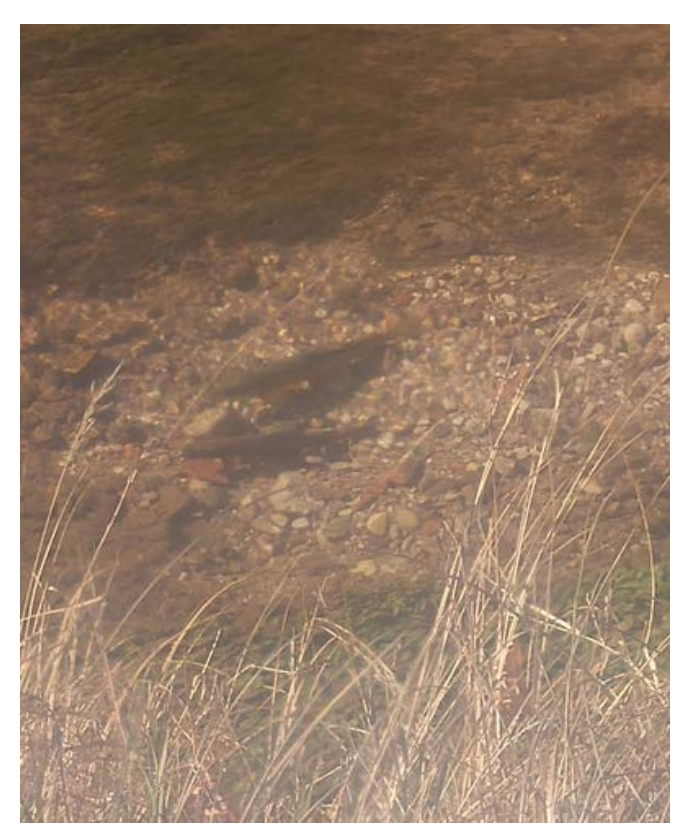
Figure 2: Photograph of a typical redd. (Close up photograph of a typical redd with spawning brown trout clearly visible).