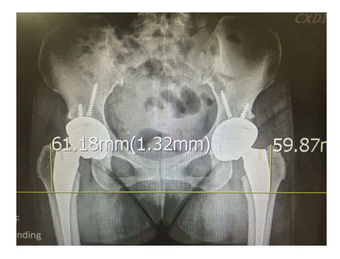
Figure 3. The postoperative leg length discrepancy was corrected to 1 mm.

The patient resumed mobility with walking assistance on the first postoperative day and was discharged on the 4th postoperative day. The postoperative LLD was corrected to 1 mm (Figure 3) and the patient did not complain a subjective LLD anymore.