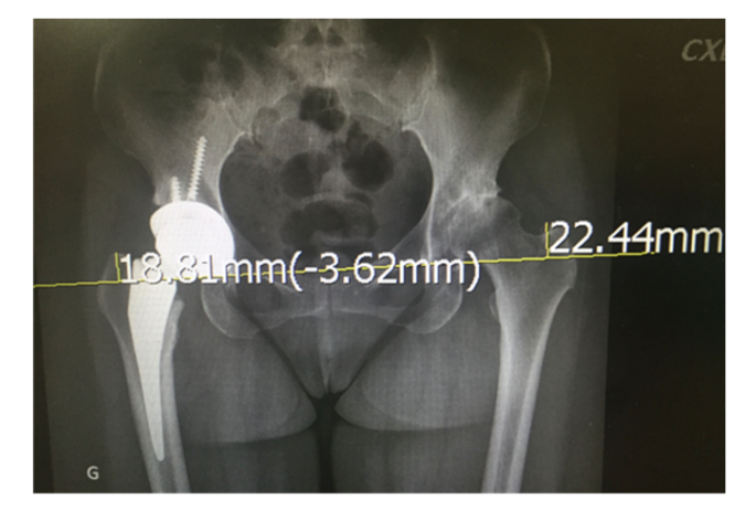
Figure 1. Leg length discrepancy of 3.6 mm was measured on preoperative X-ray.

comparison. DAA was performed and the capsule was opened. The acetabulum was reamed up to 52 mm and a 52 mm cup was impacted with 2 screws under fluoroscopic control. A cross-linked polyethylene cup of 36 mm liner was impacted in. The left femoral canal was even narrower than the right femur where the smallest stem was used. Only one round of broaching was necessary and the smallest rasp was selected for preparing the femoral canal. A trial head with a short neck on an interposition component was connected to the rasp. Trial reduction was done smoothly. The smallest femoral stem was decided (No. 0), but the trial stem slightly protruded from the cut neck. Initially, the tension of surrounding soft tissue was accepted. Then a 36 mm trial head with a short neck was used for the last trial. Unfortunately, we found it was unable to redislocate the trial head, which was trapped into the cup. All efforts were made to re-dislocate the trial head but in vain, including bending the surgical table at the hip level to facilitate the traction manoeuvre, releasing the tight capsule, using bone hook to loop the neck and pull it upwardly.