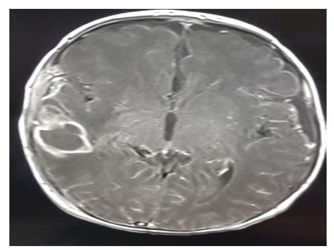
Figure 3. MRI brain: Showed the following findings: 18 mm sized ring enhancing lesion in the right temporal area (brain abscess), no mass effect.

Ampicillin). Within 48 hours of stopping the antibiotics, he developed a fever and was diagnosed to have CNS infection. Both blood and cerebrospinal fluid CSF showed growth of ESBL E. coli . Brain MRI showed an 18 mm sized ring-enhancing lesion in the right temporal area (brain abscess) with no mass effect (Figure 3). After 4 weeks of treatment, a repeat MRI brain revealed remarkable improvement in the brain abscess. The patient received 12 weeks of antibiotics and was discharged home in good condition.