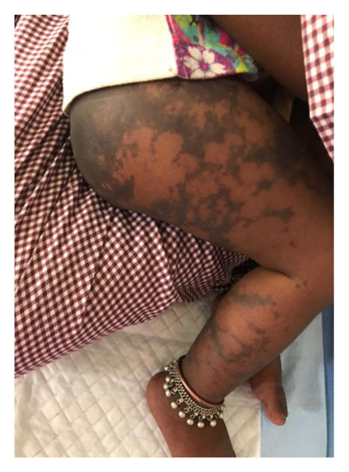
Figure 1. Child with Rickettsial fever showing Purpura Fulminans.