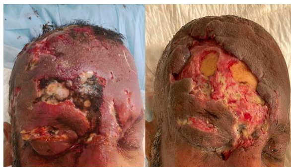
Figure 3a: Gangrenous area developed in the center of the scalp. 3b: After surgical debridement.

abscess was drained again, and surrounding necrotic tissue was debrided down to healthy orbicularis muscle (Figure 3b). Repeated debridement was carried on the next weeks. Histopathology of the scalp debrided tissue revealed marked necrotic tissues with purulent exudate. The debrided area is scheduled for later closure with a skin flap. Last ophthalmic