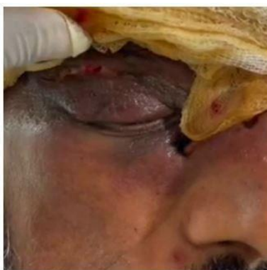
Figure 4: Last follow up for the patient by ophthalmic side showed complete resolving of the abscess with marked improvement of the lid edema and inflammation.