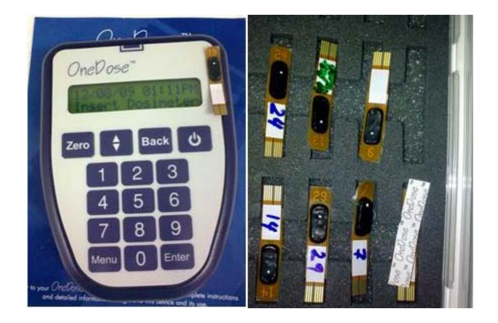
Figure 2. (Left) the OneDose system with the detector, (Right) close-up of the detector.

Table 1: Clinical stages: CTCL/mycosis fungoides (MF): TNMB classification