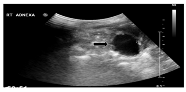
Figure 2. A pelvic ultrasound of the patient showing an ovarian cyst of the right ovary (arrow).