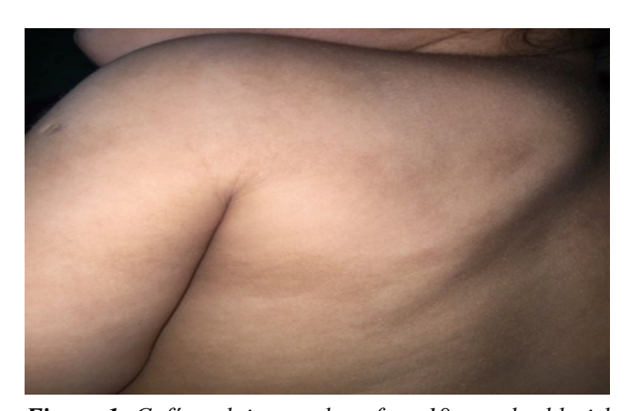
Figure 1. Café-au-lait macules of an 18-month-old girl with McCune—Albright syndrome (MAS).

Pelvic ultrasonography was performed and revealed a unilateral ovarian cyst of the right ovary measuring 2.8×2.3 cm (Figure 2). Although a skeletal survey was done and no abnormalities were detected, a bone scan was performed to confirm the diagnosis of PFD. It showed abnormal uptake of the left proximal femur and acetabulum (Figure 3).