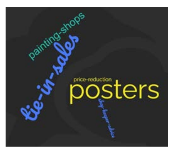
Figure 2. Promotions in distribution points.

marketing BMS but with content that confused the audience, distribution of free samples and gifts, women having seen promotional materials have been documented [52-55].