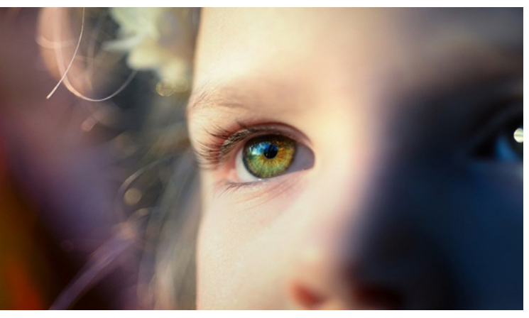
Figure 1. Effect on human eye regarding dust particle.

The inflammatory response, which consists of phagocytes, eosinophil's, mast cells, and lymphocytes, spreads along the respiratory tract, leading to tissue damage (Figure 2). Mast cells and eosinophil's are commonly recognized for their detrimental role in allergic reactions on activation through the high- and low-affinity receptors for immunoglobin E (IgE) FceRI. These cells rapidly produce and secrete many of the mediators responsible for the typical symptoms of asthma and rhinitis [15]. Exposure of the skin to air pollutants has been associated with skin aging and inflammatory or allergic skin conditions such as atopic dermatitis, eczema, psoriasis or acne, while skin cancer is among the most serious effects [16].