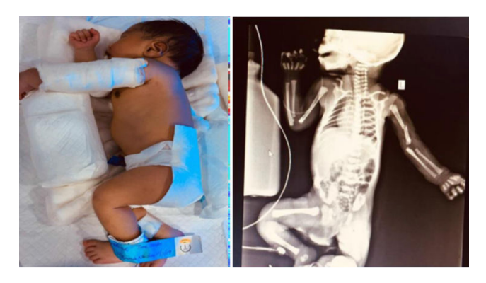
Figure 2. Fracture humerus left hand.