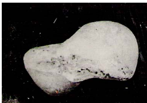
Figure.5. Vascular foramina at proximal part of dorsal ridge of scaphoid bone (dorsal view)