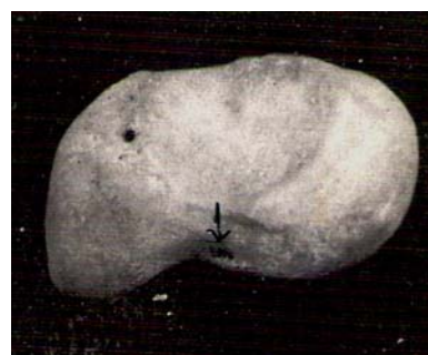
Figure 2. Vascular foramina at proximal part and one large foramen at base of tubercle of scaphoid bone (palmar view)