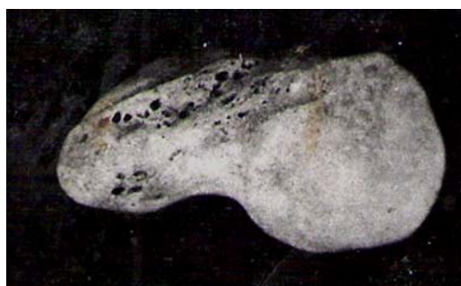
Figure 1. Vascular foramina at dorsal ridge and tubercle of scaphoid bone (dorsal view)