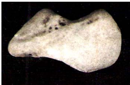
Figure.3. Vascular foramina at proximal part and mid of dorsal ridge of scaphoid bone (dorsal view)