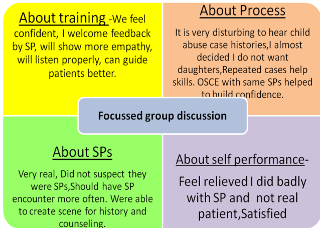
Figure 2. Focused group discussion with postgraduates.

Reflection of the PGs and USPs was taken on five aspects, namely: What was most effective, least effective, most disappointing, and difficult for you and has the process changed anything. Responses are reflected in Table 3. They reflected that unannounced SP was an effective tool, which improved their confidence and counseling skills.