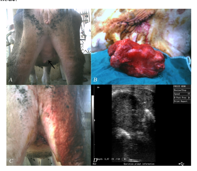
Figure 1. (A) A 17 cm-sized fibroadenoma (arrow) in the left rear quarter of an 11-month-old buffalo heifer. (B) Gross appearance of the tumor showed a smooth homogenous encapsulated lobular cauliflower-like mass. (C) Closure of the mammary wound after removal of the tumor. (D) Ultrasonographic image of the mass showing a round hypoechoic mass.

On clinical examination the buffalo was bright, alert and showed normal appetite, rectal temperature (38.7°C), respiratory rate (31 breaths/ minute) and pulse rate (66 bpm). On palpation, the affected quarter was markedly enlarged with the tumor mass that had a homogenous solid consistency (Figure 1A) without any abnormalities of the mammary lymph node.