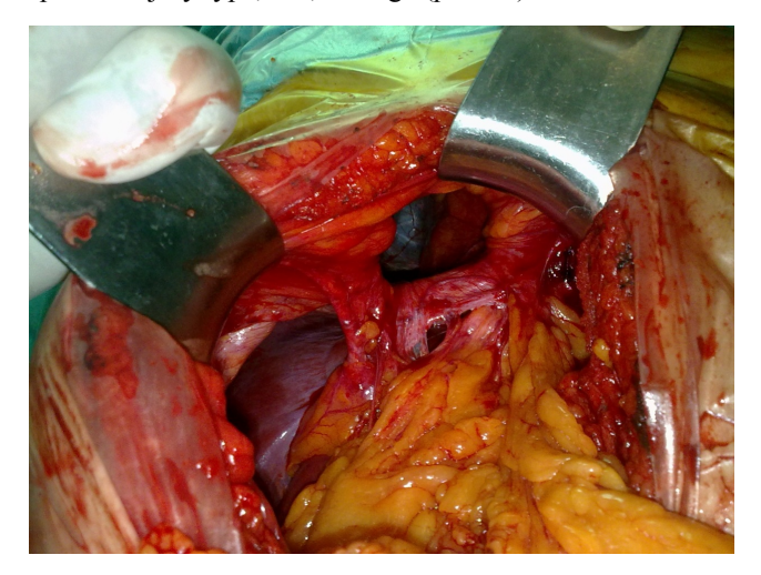
Figure 3. The view of a perforated diaphragma in a patient undergoing right thoracotomy.