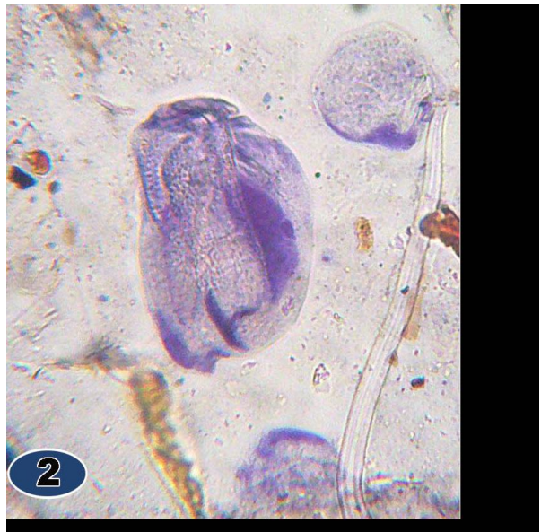
Figure 1 and 2. Line drawing and Photomicrograph of Enoploplastron triloricatum.

The macronucleus is thick, long rod shape body. It lies under the right dorsal edge of the body. The anterior end of macronucleus is smoothly rounded while the posterior end is narrow, smoothly tapering. The micronucleus is an ellipsoidal body lie in the middle of the left dorsal side of the macronucleus. There are two contractile vacuoles lying along the left dorsal edge of the macronucleus one vacuole found at the level of the anterior end of macronucleus while another near the level of the posterior end of the macronucleus.