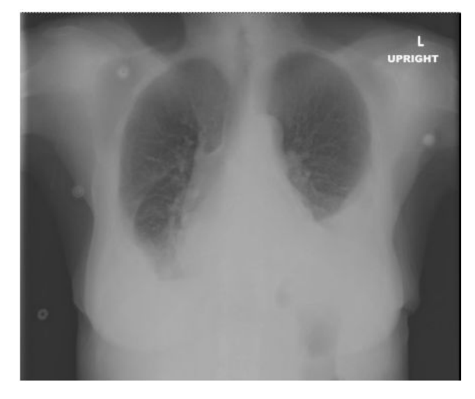
Figures 2a. CXR (P/A and Lateral)