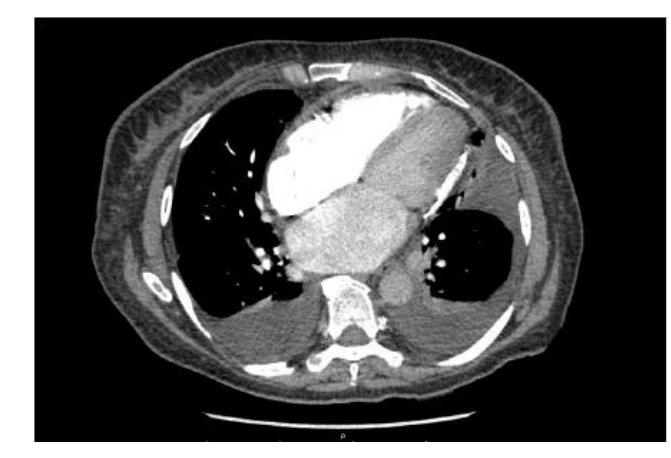
Figures 3b.CT Scan of Chest showing pericardial scarring

In the present case, despite a history of incompletely treated LTBI; no active sign and symptom of active TB was found. Multiple negative AFB samples also argued against this diagnosis and resulted in a reluctance to initiate TB treatment. However, constrictive pericarditis can be seen in the later stages of a subtle TB pericarditis. In these cases, histological evidence of necrotizing granuloma is seen in a pericardial biopsy with negative microbiological evidence of the microorganism [7]. On the other hand, pericardial biopsy has a high false negative rate for TB [5]. This and the fact that all other possible differential diagnoses were unlikely led us to the diagnosis of TB constrictive pericarditis.