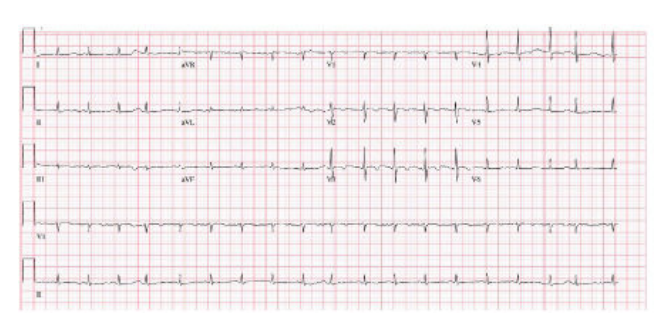
Figure 1. Patient's EKG with Low voltage