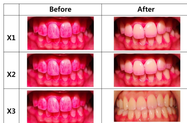
Figure 2. O'Leary index image of the saline gargle group, chlorhexidine gargle group, and Scutellaria root gargle group. X1: Oral care with 0.9% saline solution (1 min/15 ml); X2: Oral care with 0.005% chlorhexidine (1 min/15 ml); X3: Oral care with 10% Scutellaria root (1 min/15 ml).

The active bacteria count before using a gargle solution was high in all groups, and it was reduced in the order of saline gargle group, chlorhexidine gargle group, and Scutellaria root gargle group after using a gargle solution (Figure 3). As shown in Table 2, the chlorhexidine gargle group and Scutellaria root gargle group showed similar antimicrobial effects against active bacteria and Spirochaeta ( p<0.05 ).