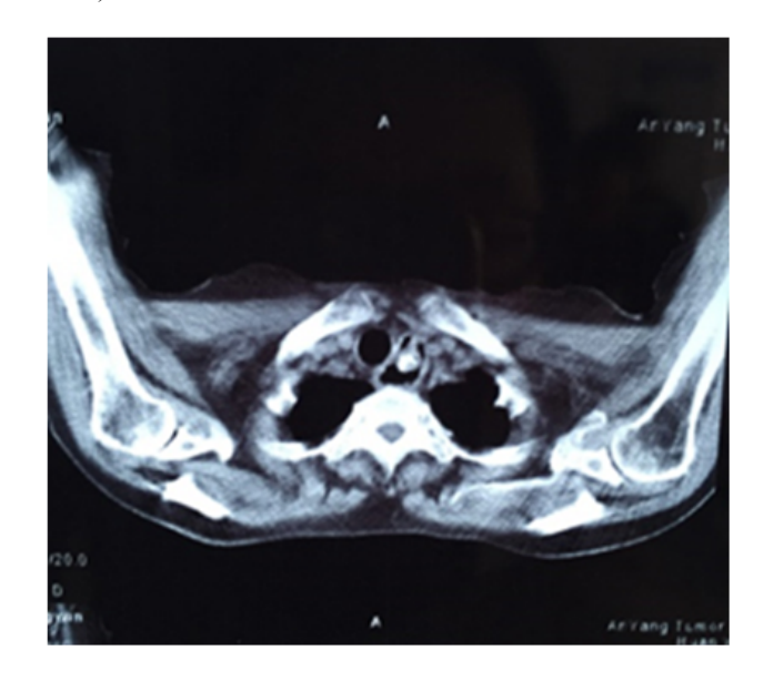
Figure 2. CT image of to show the "valve" formed by stomach residual in the cavity of tubular stomach.

anastomotic stenosis was found between two groups (p>0.05, Table 1).